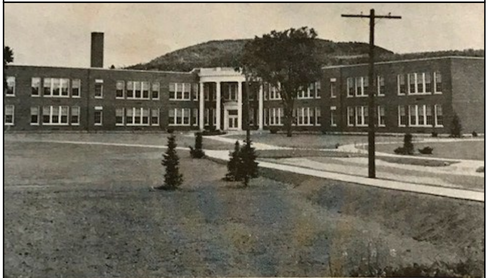
Front View of Warrensburg Central School, Sept., 1943