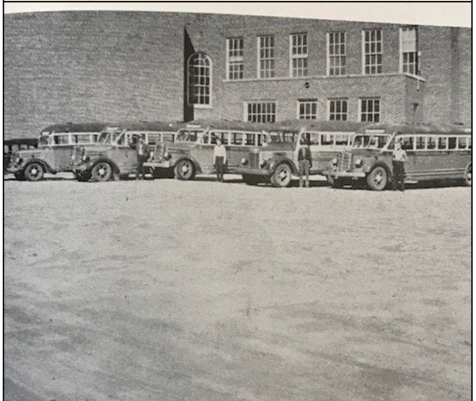
The buses after morning delivery of pupils.